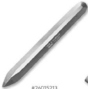
1" HAND POINT