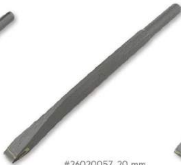
#26020057, 20 mm