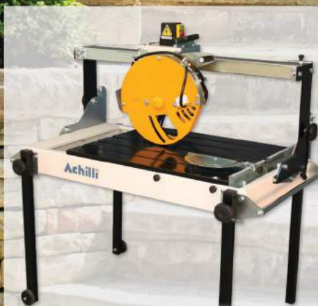
SAWS ACHILLI AMS 130