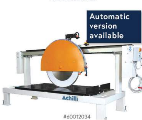
ACHILLI ADR XL