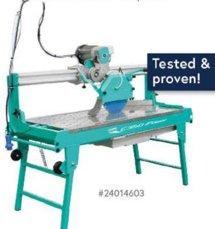
IMER COMBICUT 350/1200