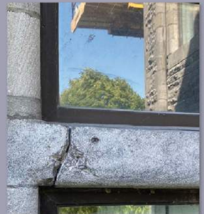
DURING | Proper cleaning & repair in progress