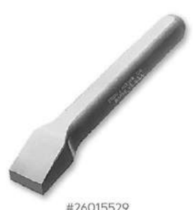
1-1/2" MASON'S CHIPPER