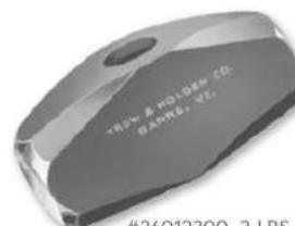
CUTTER'S HAND HAMMER