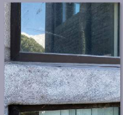
AFTER | The repair is invisible!