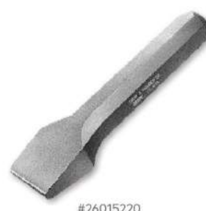
2" HAND SET