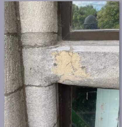
BEFORE | Improper repair with wrong products

PERFORMING AN INVISIBLE REPAIR IS POSSIBLE WITH BONSTONE PRODUCTS