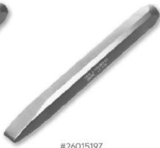
1" HAND CHISEL