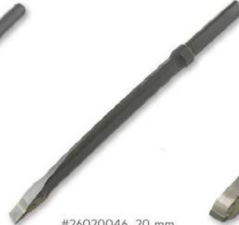
#26020046, 20 mm