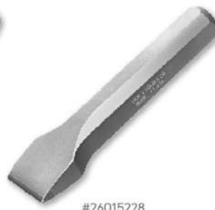
1-1/2" HAND TRACER