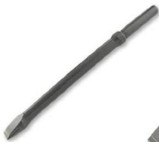
#26020008, 20 mm