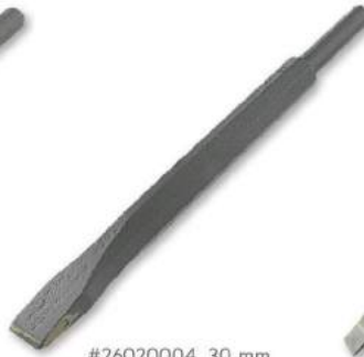
#26020004, 30 mm