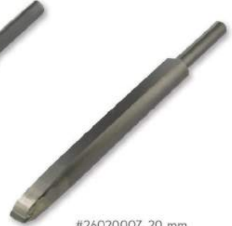
#26020007, 20 mm