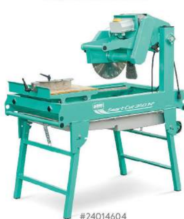
IMER SMARTCUT 350