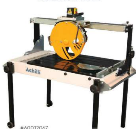
ACHILLI AMS 130 HT