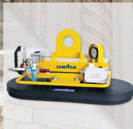
LIFTING DEVICES WEHA EP-600

TOOLS, PRODUCTS, EQUIPMENT & SERVICES FOR STONE