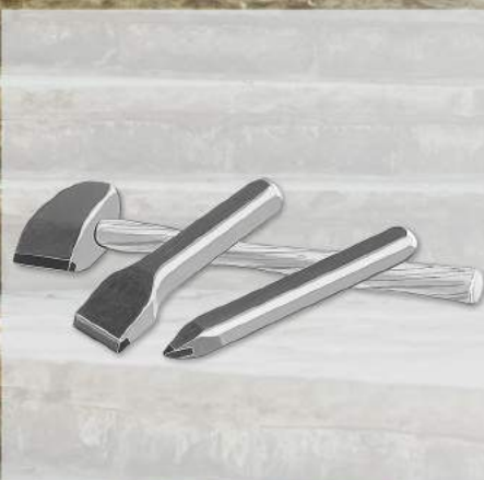
CARBIDE HAND TOOLS TROW & HOLDEN