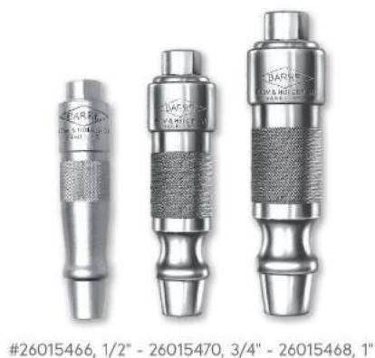
TROW & HOLDEN